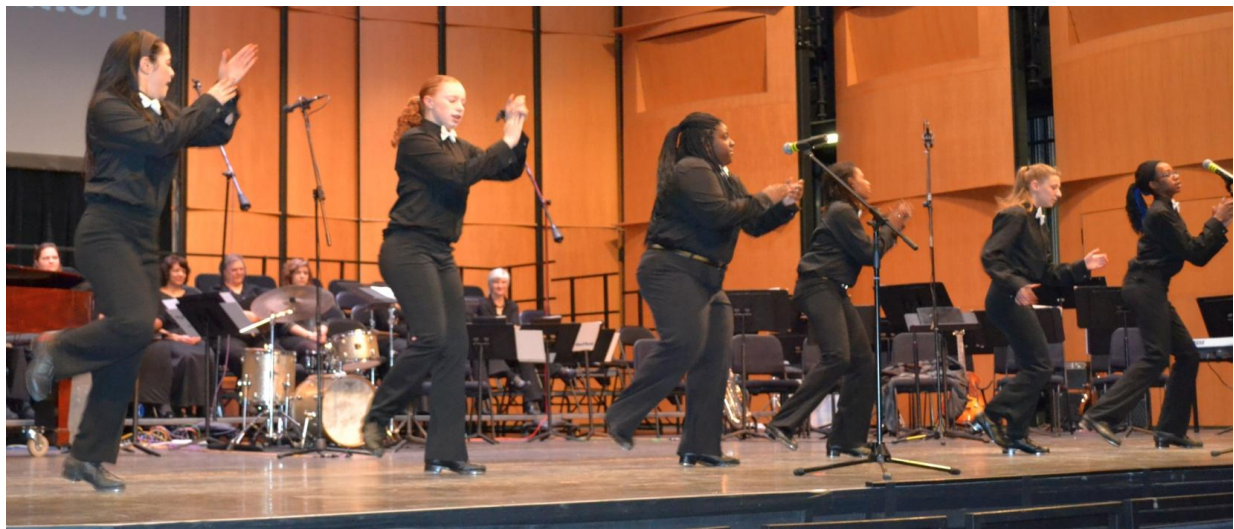
Metropolitan Youth Tap Ensemble