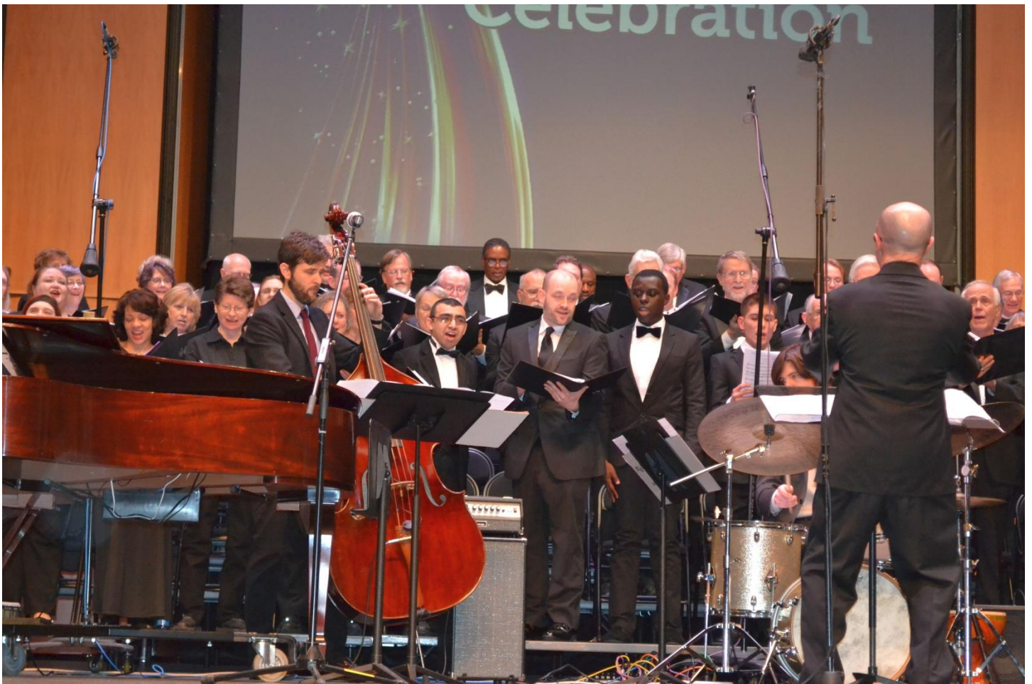
NOVA Community Chorus