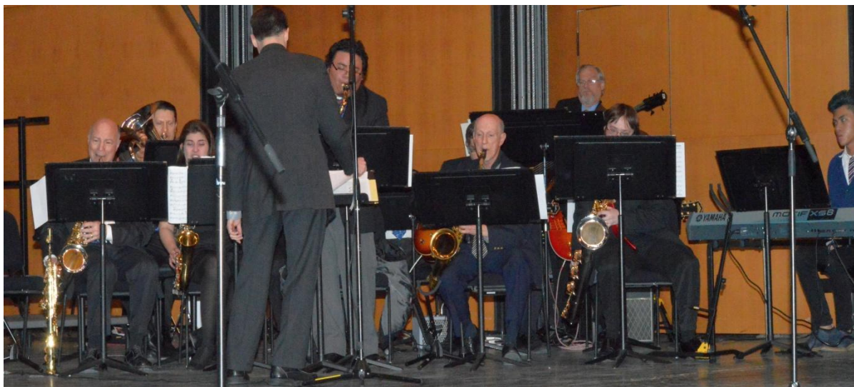
Go Tell It On the Mountain NOVA Jazz Ensemble