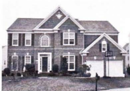
Recent Under Contract Listing

MY REPRESENTATION IS FOR YOU ONLY—NO DUAL REPRESENTATION!