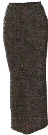
Youth Long Campus Skirt I404 ONLY: $28.00 Youth Long Campus Skirt