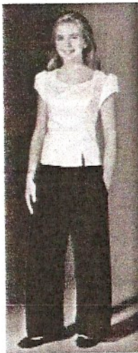
Youth Palazzo Pant I402 ONLY: $34.00