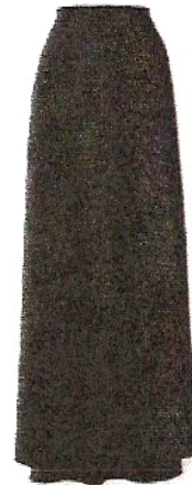
Youth Crepe Concert Skirt I477 ONLY: $28.00