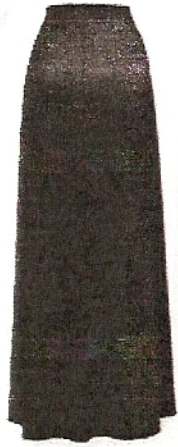
Long Crepe Concert Skirt I687 ONLY: $28.00 Washable Crepe Skirt with back zipper.