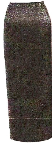
Adult Campus Skirt I941 ONLY: $30.00